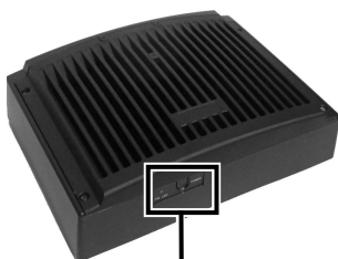
Power Switch with LED Indicators