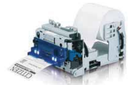
PMU2300III without presenter