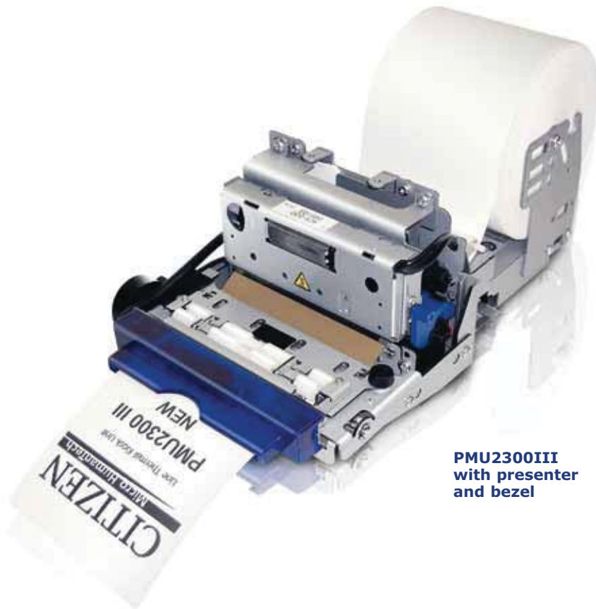
PMU2300III with presenter and bezel

The compact size kiosk printer with all features you need