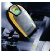
Hand Held scanners