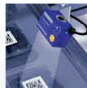
Stationary Industrial Scanners