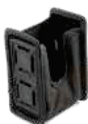
HLS-P080 Universal Holster (HLS-8000)