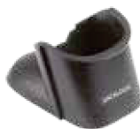
HLD-P080 Desk/Wall Holder (HLD-8000)