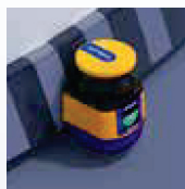
Safety Laser Scanner