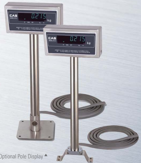
Optional Pole Display ▲