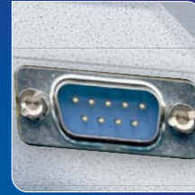
RS-232C Serial Port