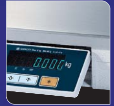
Tiltable VFD Display