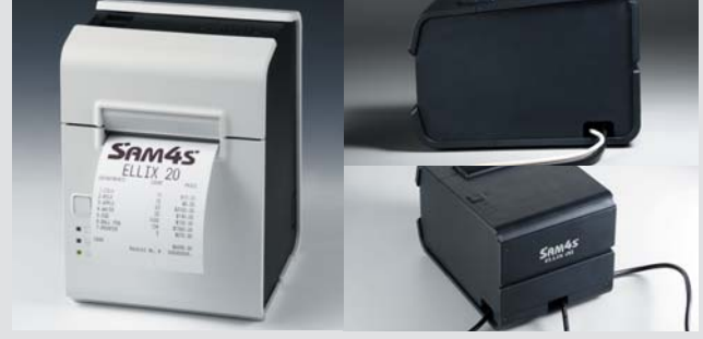
Stand Wire arrangement