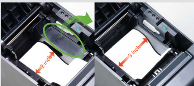
2 inch (58mm)-separator 3 inch (80mm)