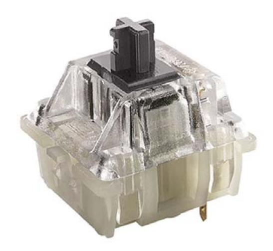
Models may vary from the image shown