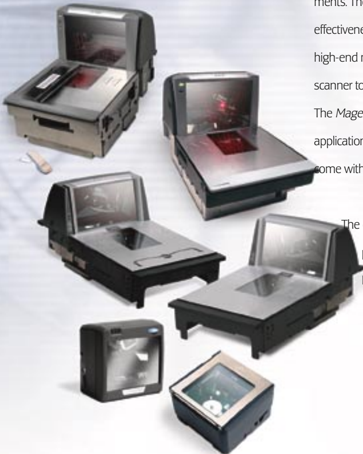
The Magellan line of high-performance bar code scanners

The complete Magellan line of scanners are built from a common platform with common features to increase productivity and enhance POS system efficiency.