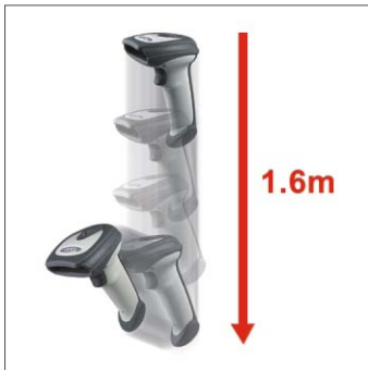
Durable design withstands multiple drops from 1.6 meters