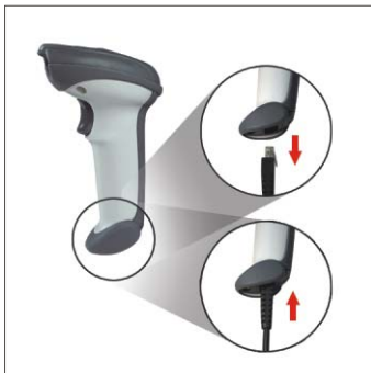
Snap-in, detachable interface cables design link to most popular hosts