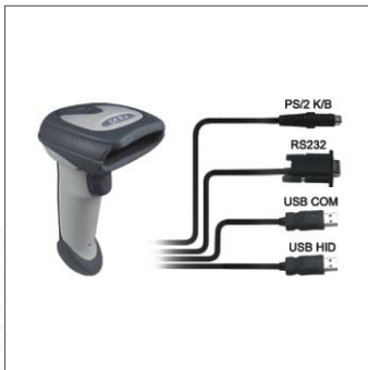
Compatible with most popular hosts by "all-in-one" universal interface